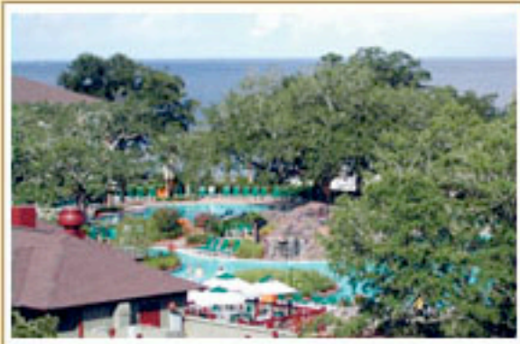
New Pools and Spa

Please Contact us for your planning services.