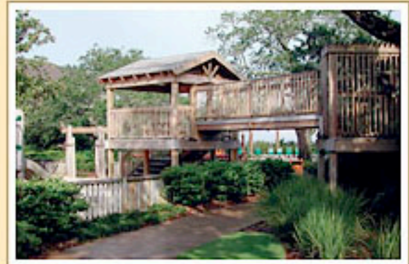
Tom Sawyer Tree House on the Bay

Click Below for More Information and Newsletters: